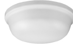
617-960 MHz & 1695-2690 MHz Omni SISO Antenna